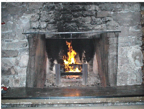
Fireplace in Riley Lodge

Friday evening will find the group roasting hotdogs and marshmallows at the large fireplace in Riley Lodge as we arrive at Sky Lake. Some arrive earlier than others there is no set time for arrival.