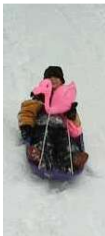
Sleigh Riding with a Flamingo?