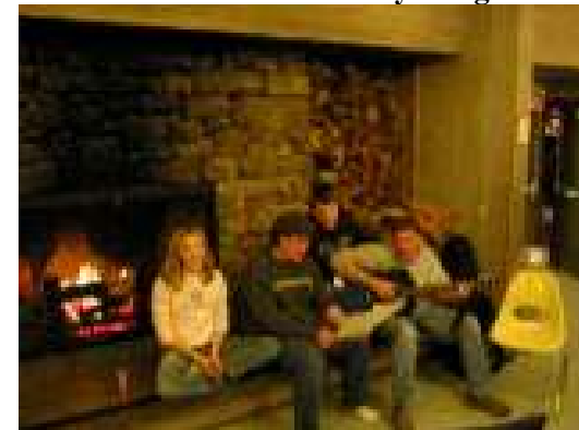
Singing by the fire