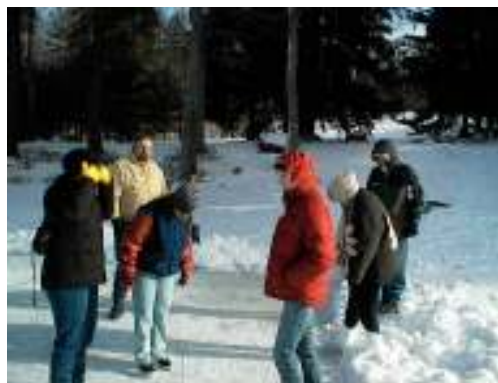
Skating on the Lake