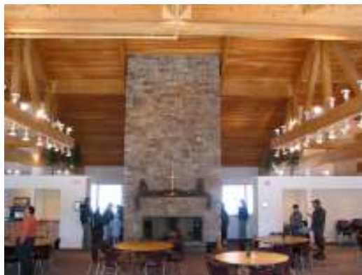
Founder's Lodge Dining Area

Getting there is easy by directions, following another car or sharing a ride.