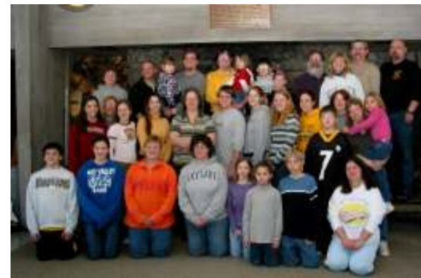
2005 Sky Lake Group

For more information about Sky Lake visit www.skylakecenter.org